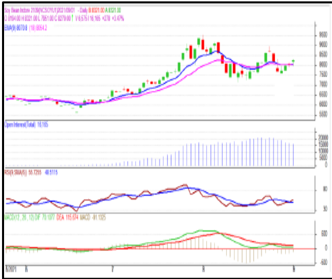
NCDEX RM Seed Futures September Contract