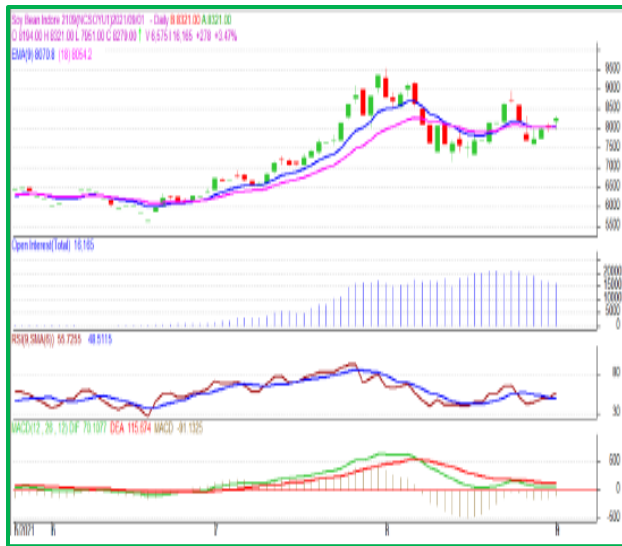
NCDEX Soybean Futures – September Contract